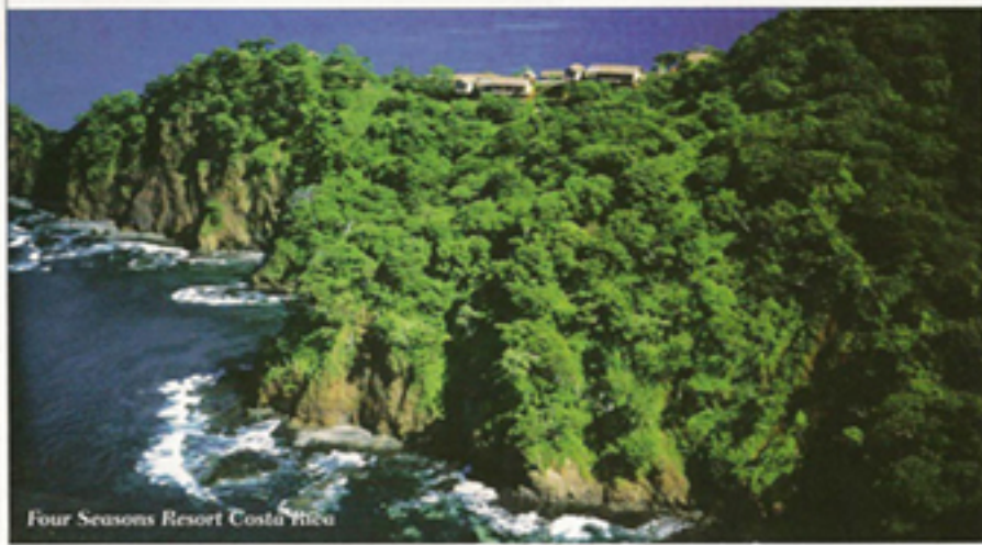
Four Seasons Resort Costa Rica

Situated on 27 acres in the middle of Carneros' lush, rolling agricultural landscape, the inn offers guests a true farm ambience far removed from the idealized, often self-conscious "country" inns found elsewhere in the Sonoma and Napa regions. The gated compound, where it is not enclosed by fencing, is set off from the main road by rolling fields and vineyards that come up literally to the porches of the guest cottages, which can best be described as Steinbeck modern. Inside the planked and corrugated tin structures—each of which has a themed garden of its own—one discovers clean contemporary lines, thoughtful applications of natural materials, and amusingly postmodern touches, such as Le Corbusier and Philippe Starck furnishings. State-of-the-art water recycling and geothermal heating and cooling systems speak to the practical side of Rogal's inspiration, as do the spa treatments, which utilize local materials (a grape seed body scrub, for example). At the Hilltop restaurant, Executive Chef Philip Wang transforms local ingredients into culinary artworks. "We have worked to ensure that our guests' experiences are anchored in the place," says Rogal. Even the black-and-white photographs that adorn the inn's rooms and halls are true to this philosophy: They