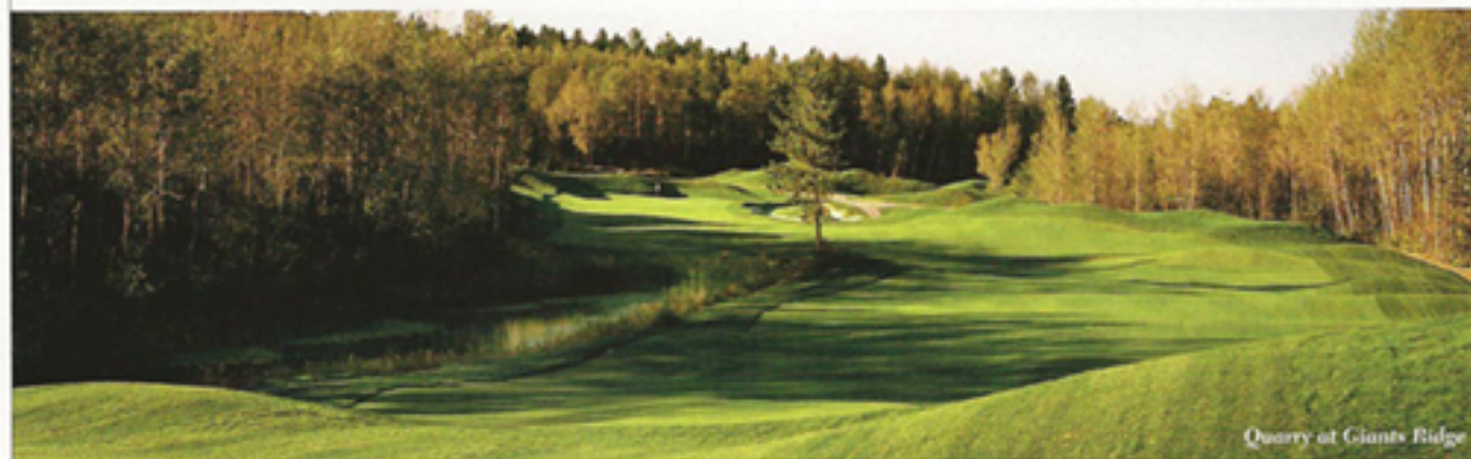
Quarry at Giants Ridge