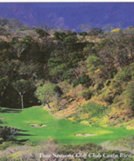
Four Seasons Golf Club Costa Rica

Four Seasons Golf Club Costa Rica, +50.66.96.0000, www.fourseasons.com